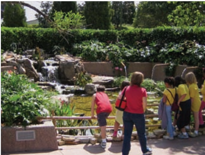
Epcot Center 2006

Education is key in most parks and recreational areas and the focus has become water conservation. It's the most precious resource we have and it's the #1 concern throughout the world. The public needs to understand how they can make a difference and what it will do for us all in the long run.