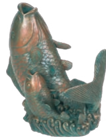
Double Fish Spitter