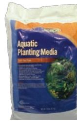
Aquatic Planting Media

Environmental Enhancement Certified Aquascape Contractor Call for a design consultation 940 627-3796/817 269-0654 www.dfwponds.com