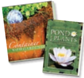
The Hobbyist's Guide to Pond Plants