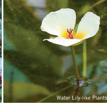
Water Lily-like Plants