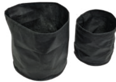
Aquatic Plant Pot